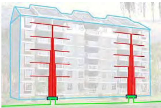
FTTH drop cable application

RoHS (Restriction of Hazardous Substances) compliance.