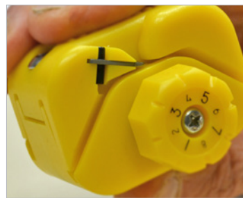
Spring-loaded design eliminates need to lock or clamp tool while in use.