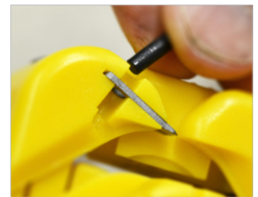
Fixed stainless steel blades require no adjustments and replace easily.

For more information or to locate the nearest authorized Ripley® distributor, please visit www.ripley-tools.com or call 1 (800) 528-8665 to speak to a customer service representative.